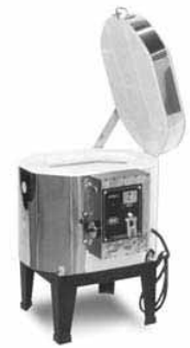
120v Doll or Test Kiln