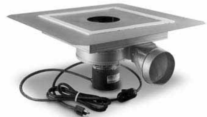
Plate Mount Version